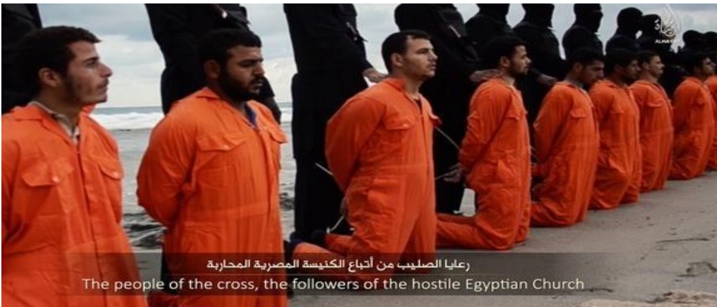
رجال الصليب من أتباع الكنيسة المصرية المحاربة

The people of the cross, the followers of the hostile Egyptian Church